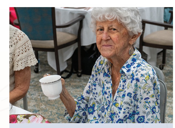
A resident enjoys a cup of tea at the High Tea Gala.

While the shape of the building stayed the same, the inside has an all-new, updated look that is not only more appealing but much more user-friendly.