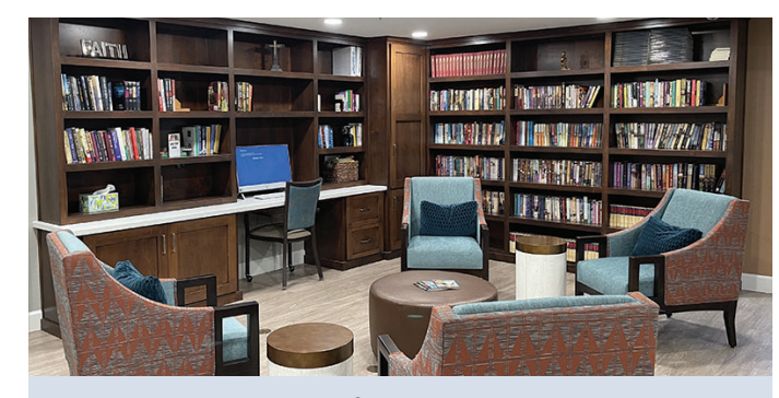
A redesigned library features more usable space, a computer for resident use, and a comfortable place for socializing.