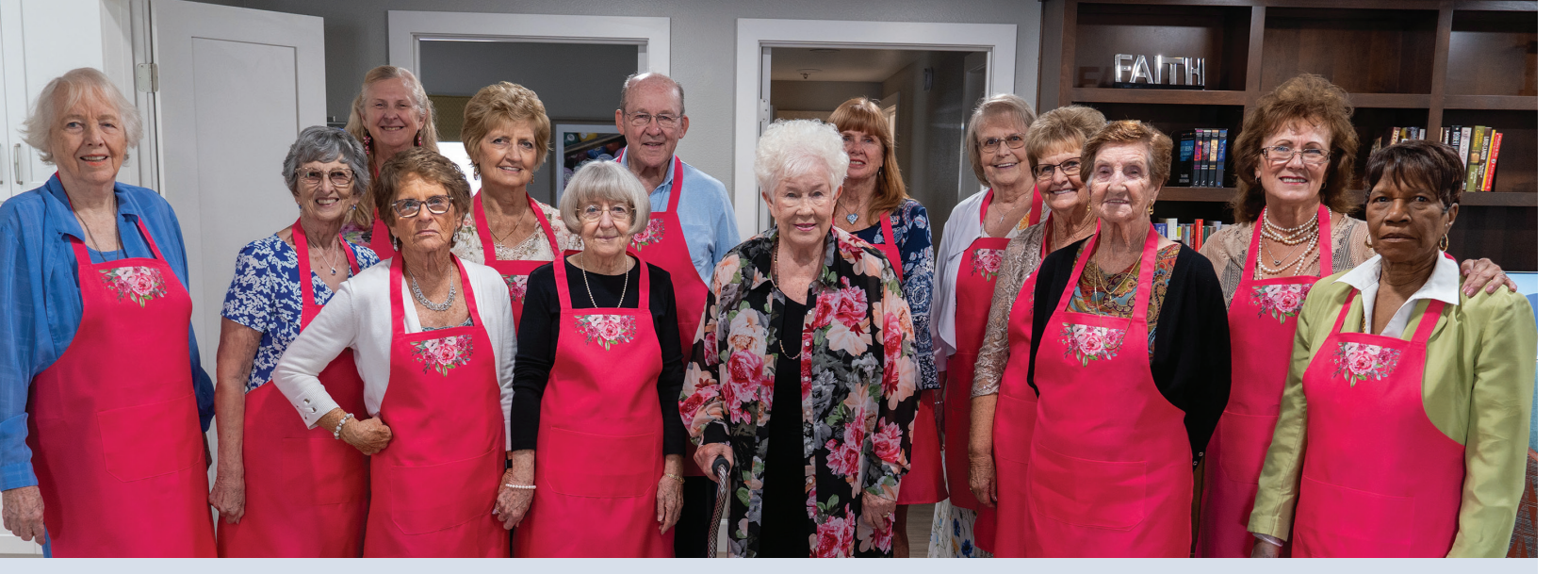
A group of volunteers helped make the High Tea Gala a success.