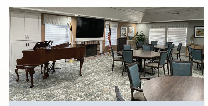
New furnishings, carpet, light fixtures, and cabinetry give the Friendship Center a modern look.