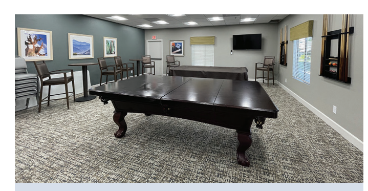
Upgrades to the game room create a spacious, welcoming environment for residents to shoot a game of pool.

The Friendship Center remains available for a variety of functions and can be reserved for private events by contacting the ICH reception desk at (909) 467-6155.