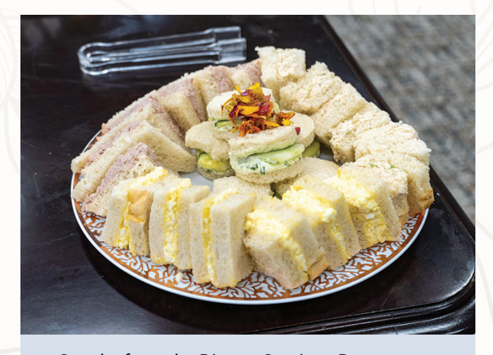
Snacks from the Dietary Services Department.